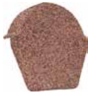
End Cap Fits over the end of the ridge tile and forms a perfect seal