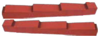
Dry Verge Length: 111cm Width: 10.7cm Height: 12cm Usable surface: 94cm