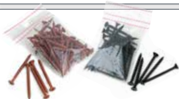
Plastic Coated Screws (Available colour coded) 40 x (4.0 x 45)

This roofing system is made from a mixture of virgin and recycled polypropylene plastic, resulting in an incredibly tough, durable, lightweight roofing solution.